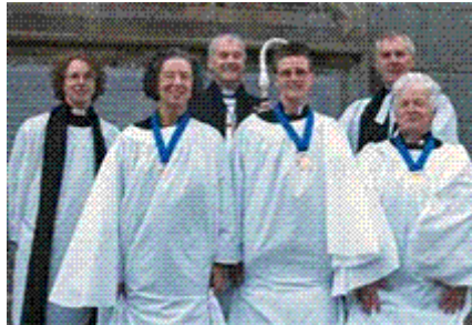
Newly appointed Parish Readers in Clogher Diocese