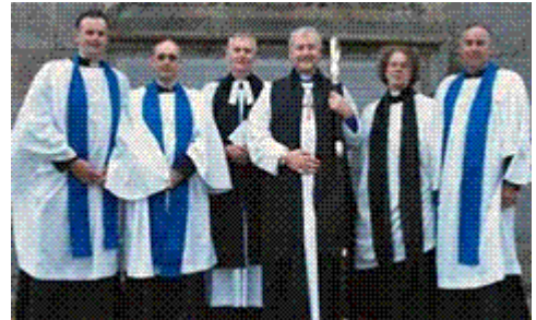
Newly commissioned Diocesan Lay Readers in Clogher Diocese