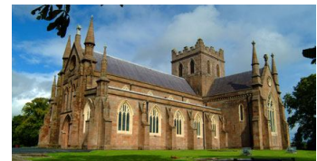
St. Patrick's Cathedral, Armagh

Armagh is the ecclesiastical (or church) capital of Ireland ever since St Patrick set up his headquarters there in the fifth century. Thus the Cathedral there is dedicated to St Patrick.